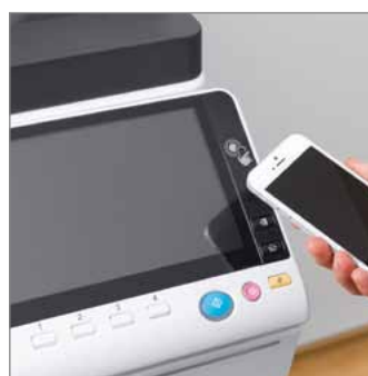
New area for Near Field Communication (NFC) Authentication