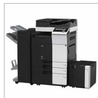
Configuration with FS-534SD Finisher, PC-410 Tray, LU-302 Large Capacity Tray, and DF-704 Document Feeder