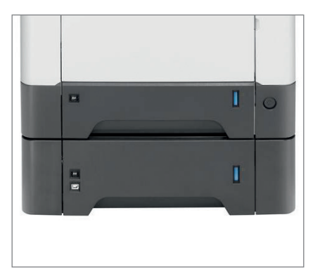
Flexible paper management