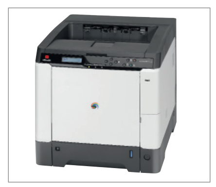
Compact and easy to use