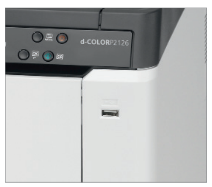
USB port for printing from memory sticks